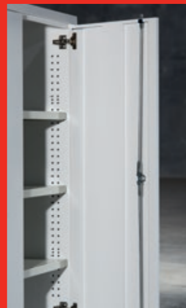
Lockable doors provide extra security for sensitive documents.