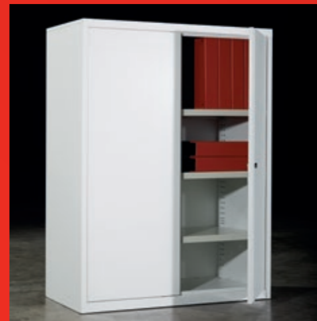
With doors, swing door cabinet.