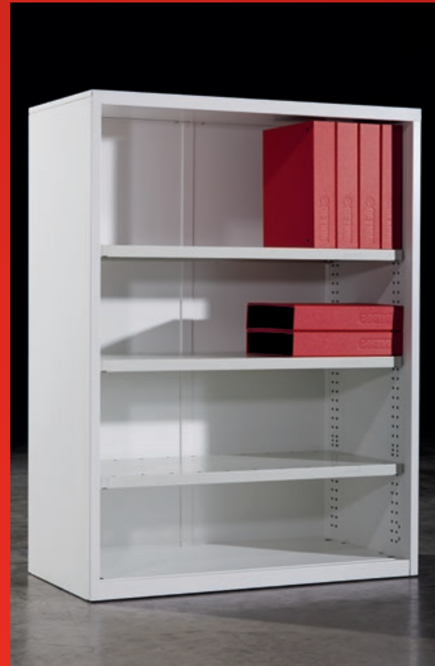
Without doors, bookcase.