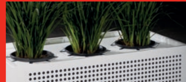
Perforated planter, provides acoustic dampening.