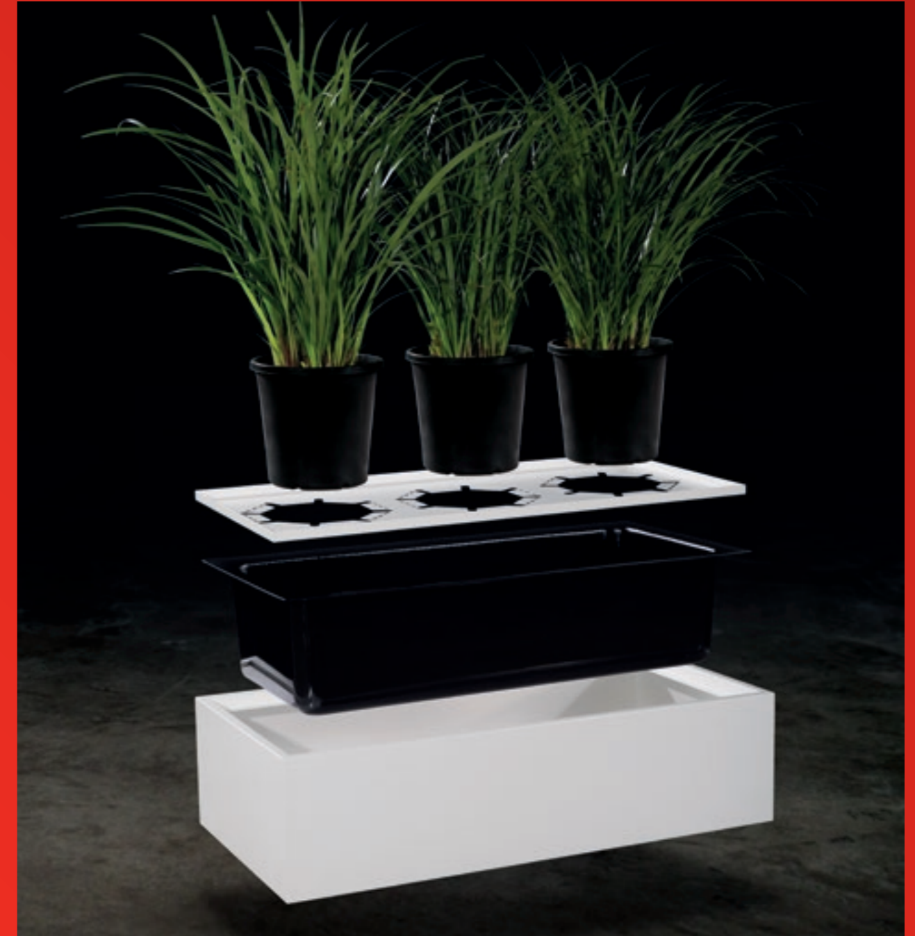
The Strata 2 planters have been designed to work together with the entire suite of Strata 2 cabinets. The modular design accommodates all plant types, and ensures easy maintenance and care.